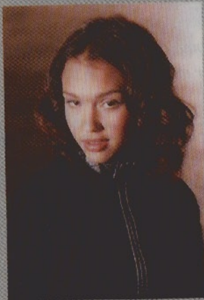
Jessica Alba stars as Max, a genetically enhanced, martial arts-trained soldier, in Dark Angel .

HOLLYWOOD—Oscar-winning director James Cameron ( Titanic , The Terminator ) is producing a new